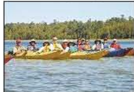
Woods & Water Ecotours leads outings through the Les Cheneaux Islands, Mich.